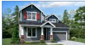
GV: Grandview 5 Bed / 3 Bath / 2,936 sq. ft.