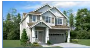
AS: Aspen II 4 Bed / 3 Bath / 2,560 sq. ft.