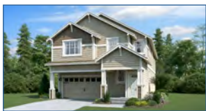
MG: Magnolia 4 Bed / 2.5 Bath / 2,540 sq. ft.