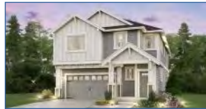
MG: Magnolia II 4 Bed / 2.5 Bath / 2,540 sq. ft.