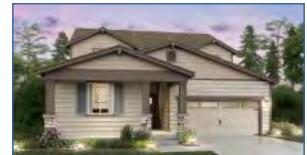
BA: Bainbridge II Next Gen® 4 Bed / 3 Bath / 3,215 sq. ft.