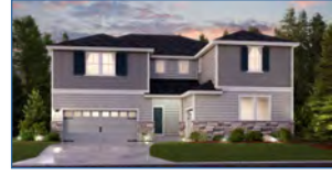
CM: Camano Next Gen® 5 Bed / 4.5 Bath / 4,194 sq. ft.

32301 SE 236th Avenue, Black Diamond, WA 98010 | 855-860-9575 | Lennar.com/TenTrails LENNAR®