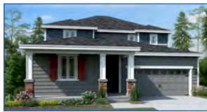
BA: Bainbridge Next Gen® 4 Bed / 3.5 Bath / 3,215 sq. ft.