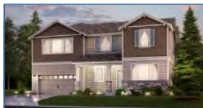
WP: West Port 4,036 sq. ft.