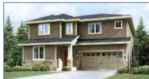
WH: Whitman 5 Bed / 4 Bath / 3,862 sq. ft.