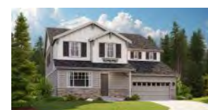
RS: Roslyn 4,090 sq. ft.