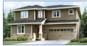
WH: Whitman 5 Bed / 4 Bath / 3,862 sq. ft.