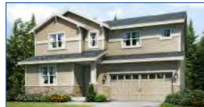
CA: Carnation 4 Bed / 3 Bath / 3,017 sq. ft.