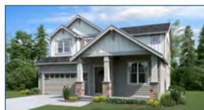
CK: Clark 4 Bed / 2.5 Bath / 2,786 sq. ft.