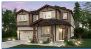
BY: Bailey 5 Bed / 3.5 Bath / 3,598 sq. ft.