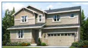
CA: Carnation 4 Bed / 3 Bath / 3,017 sq. ft.