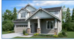
CK: Clark 4 Bed / 2.5 Bath / 2,758 sq. ft.