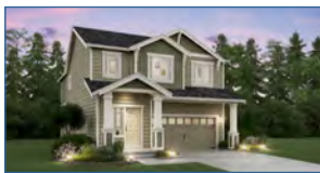
AS: Aspen 4 Bed / 3 Bath / 2,560 sq. ft.