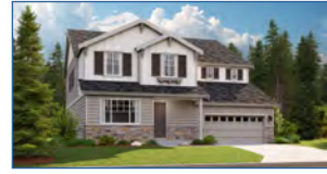
RS: Roslyn 5 Bed / 4.5 Bath / 4,090 sq. ft.