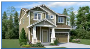
HK: Hickory 4 Bed / 2.5 Bath / 2,350 sq. ft.