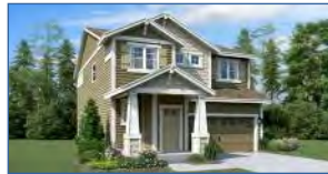
HI: Hickory II 4 Bed / 2.5 Bath / 2,350 sq. ft.