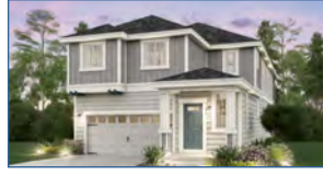
SQ: Sequoia 5 Bed / 3.5 Bath / 2,989 sq. ft.