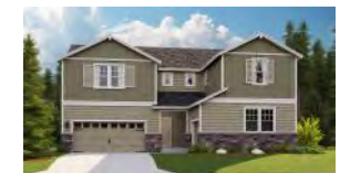
CM: Camano 4,194 sq. ft.

32301 S.E. 236th Avenue, Black Diamond, WA 98010 | 855-860-9575 | Lennar.com/TenTrails