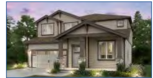
CL: Clark II 4 Bed / 2.5 Bath / 2,758 sq. ft.