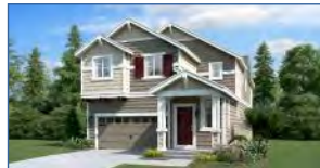
SQ: Sequoia II 5 Bed / 3.5 Bath / 2,989 sq. ft.